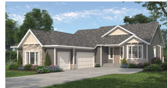
LANCASTER II BUNGALOW 1,740 sq. ft. 1 bed 1.5 bath

We offer four meticulously designed models, each home catering to your unique tastes and preferences. Our commitment to high-end design and building ensures that every aspect of your dream home reflects your discerning lifestyle.