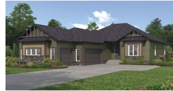
EMERSON BUNGALOW 1,556 sq. ft. 1 bed 1.5 bath