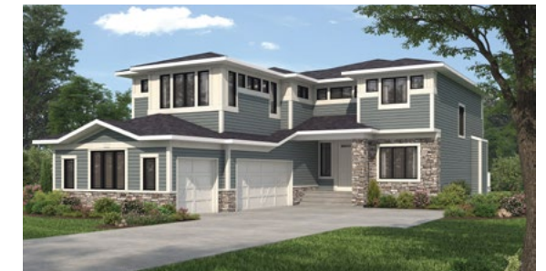
LANCASTER II 3,081 sq. ft. 3 bed 2.5 bath