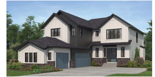
HAZELTON 2,457 sq. ft. 3 bed 2.5 bath