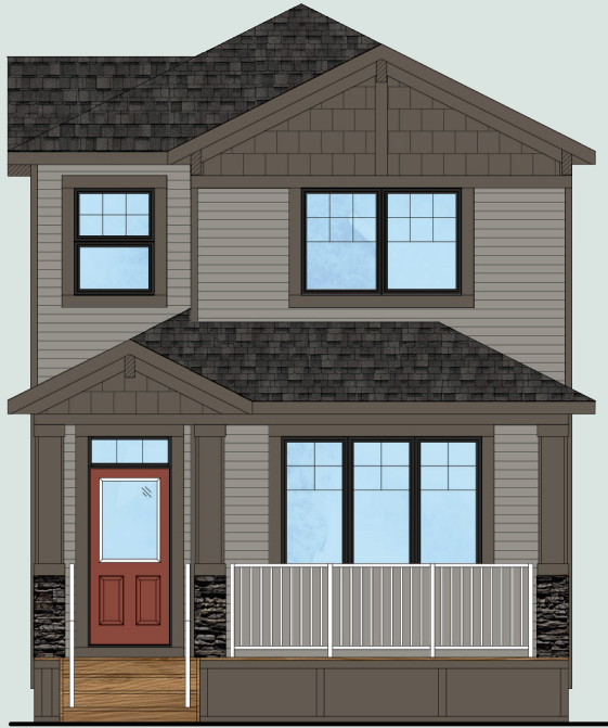
INTERNAL STREET ELEVATION