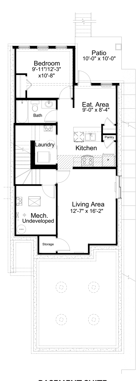
749 sq. ft.