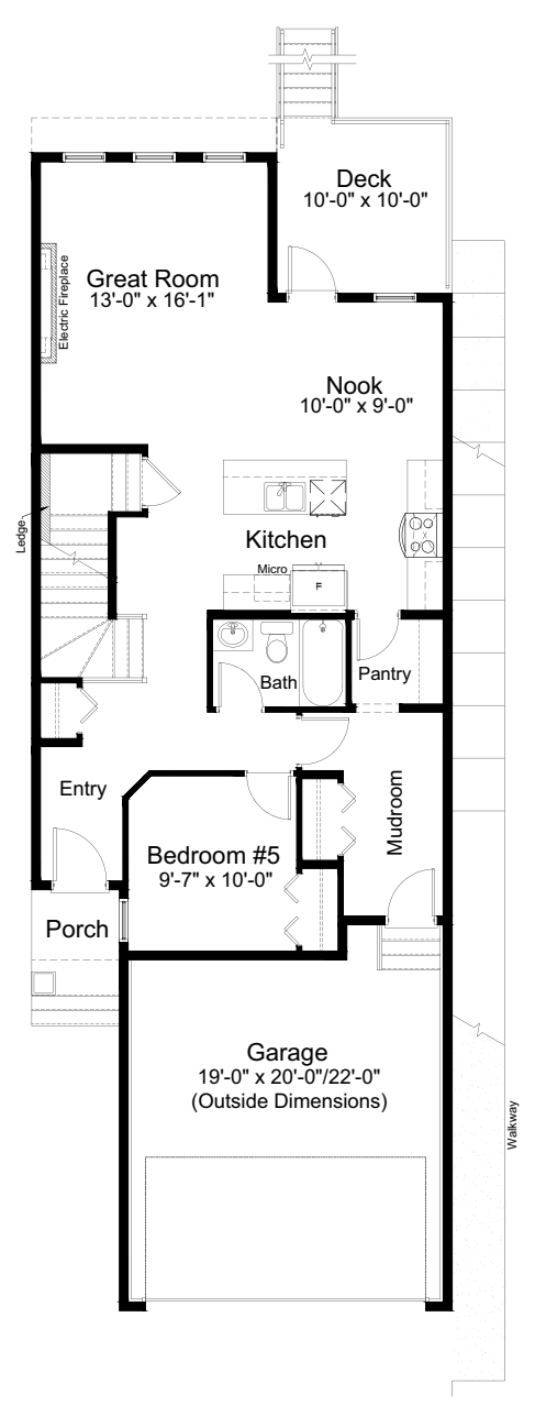
MAIN FLOOR 992 sq. ft.