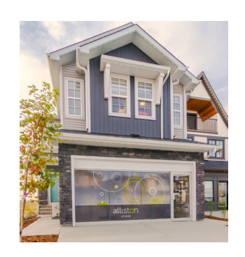
FARMHOUSE #2 ELEVATION

The builder reserves the right to modify or change plans, specifications, features and prices without notice. Materials may be substituted with equivalent or better at the builder's sole discretion. All dimensions and sizes are approximate and are based on architectural measurements. As reverse, mirrored and/or flipped plans occur throughout the building, please see architectural plans if material to your decision to purchase. Renderings, furnishings and equipment shown are an artist's conception and are intended as a general reference only. Please see disclosure statement for specific offering details. E. & O.E.