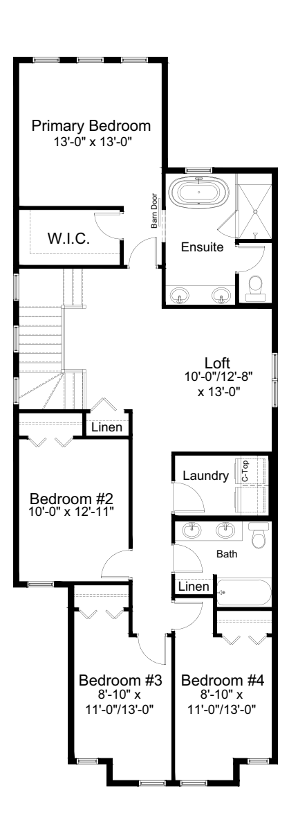
UPPER FLOOR 1,380 sq. ft.