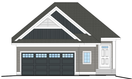
CRAFTSMAN #1 ELEVATION

Edited: October 7, 2024 The builder reserves the right to modify or change plans, specifications, features and prices without notice. Materials may be substituted with equivalent or better at the builder's sole discretion. All dimensions and sizes are approximate and are based on architectural measurements. As reverse, mirrored and/or flipped plans occur throughout the building, please see architectural plans if material to your decision to purchase. Renderings, furnishings and equipment shown are an artist's conception and are intended as a general reference only. Please see disclosure statement for specific offering details. E. & O.E.