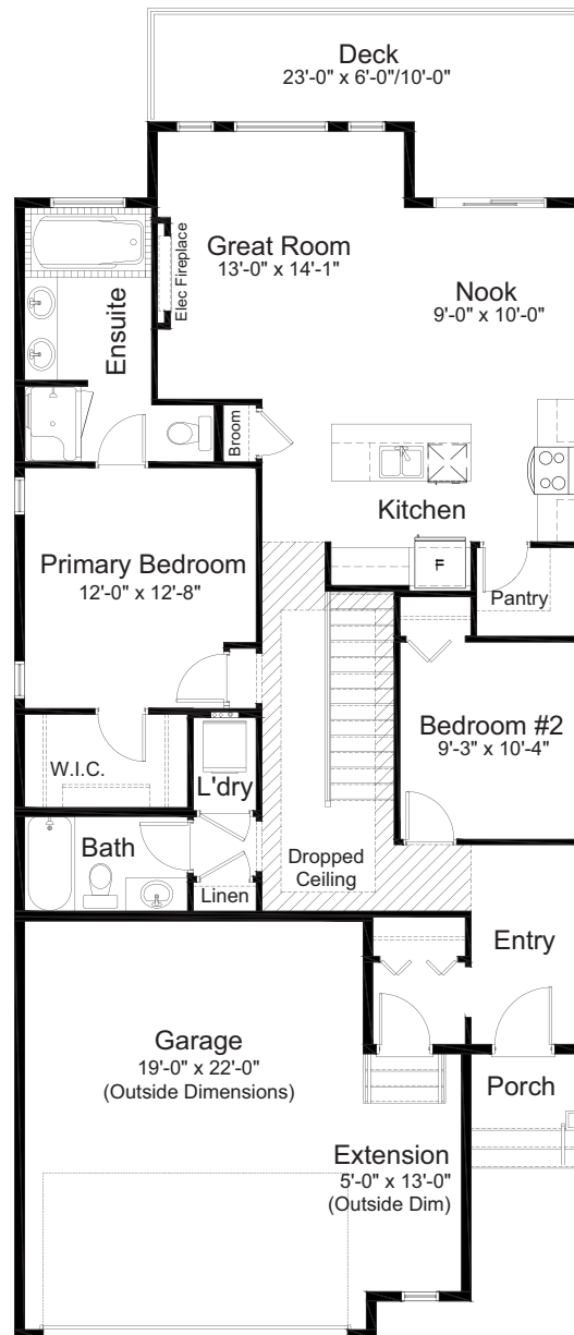
MAIN FLOOR 1,278 sq. ft.