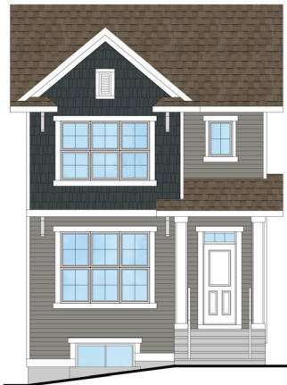
CRAFTSMAN #1 ELEVATION

The builder reserves the right to modify or change plans, specifications, features and prices without notice. Materials may be substituted with equivalent or better at the builder's sole discretion. All dimensions and sizes are approximate and are based on architectural measurements. As reverse, mirrored and/or flipped plans occur throughout the building, please see architectural plans if material to your decision to purchase. Renderings, furnishings and equipment shown are an artist's conception and are intended as a general reference only. Please see disclosure statement for specific offering details. E. & O.E.