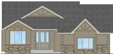
CRAFTSMAN II ELEVATION