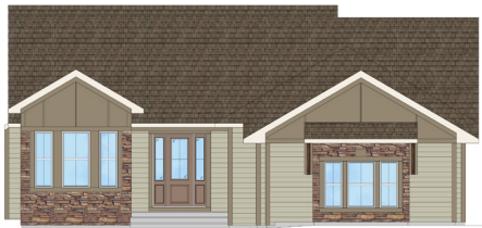
CRAFTSMAN II ELEVATION