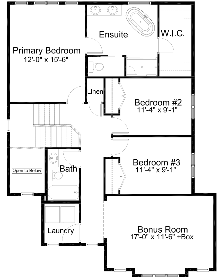
UPPER FLOOR 1,199 sq. ft.