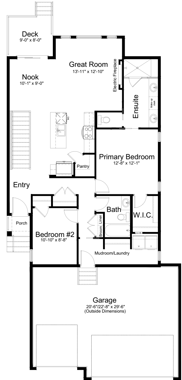
UPPER FLOOR 1,241 sq. ft.